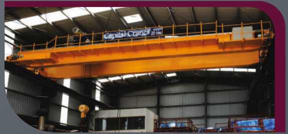
Double Girder EOT Crane