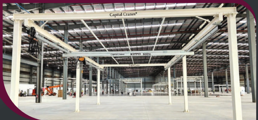
Light Crane System

"The Experienced choice for Industrial Cranes"