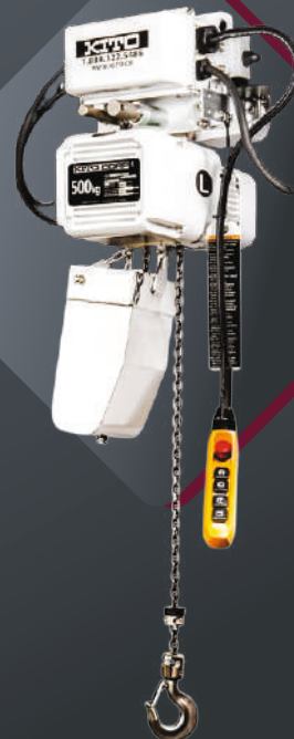
Food Grade Hoist