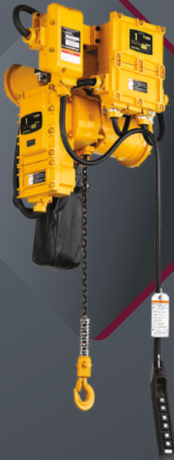
Explosion Proof Hoist