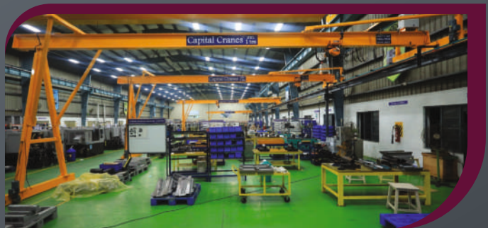
Semi Gantry Crane