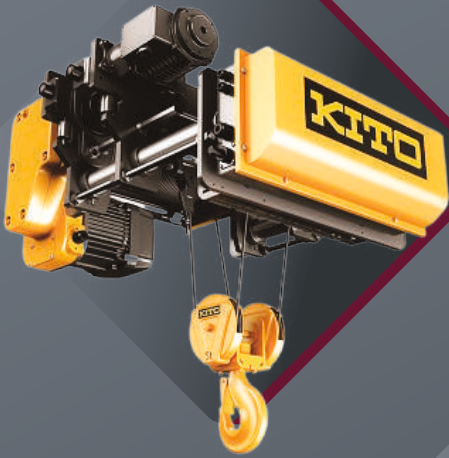
Single Girder Hoist