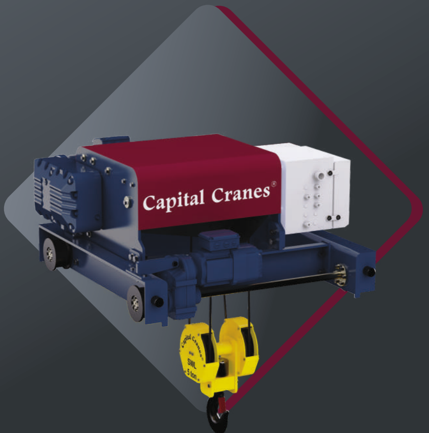
Double Girder Hoist