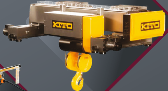
Double Girder Hoist