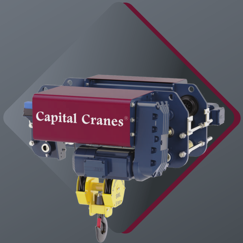
Single Girder Hoist

Hook : High Tensile Forged Steel, 360° Rotation with Safety latch.